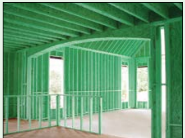
There is only one chance to install mold-resistant wood: when the home is built. The FrameGuard® treatment prevents mold growth and thus reduces airborne mold spores.