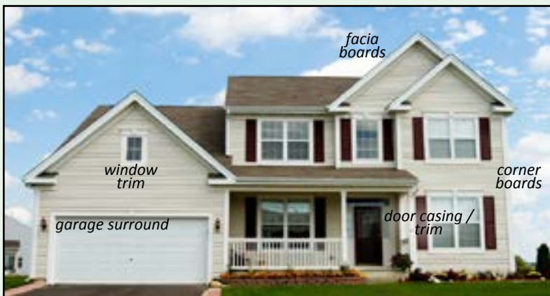
When appropriately primed and coated, FrameGuard® Total™ wood is a beneficial choice for exterior trim.

RECOGNIZED FOR ITS GREEN CHARACTERISTICS