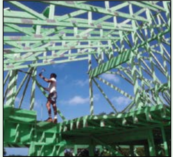
FrameGuard® treatment keeps lumber looking cleaner and brighter during storage, construction, and beyond. This is especially important to truss and component manufacturers whose end products tend to be exposed to the elements longer than other framing materials.