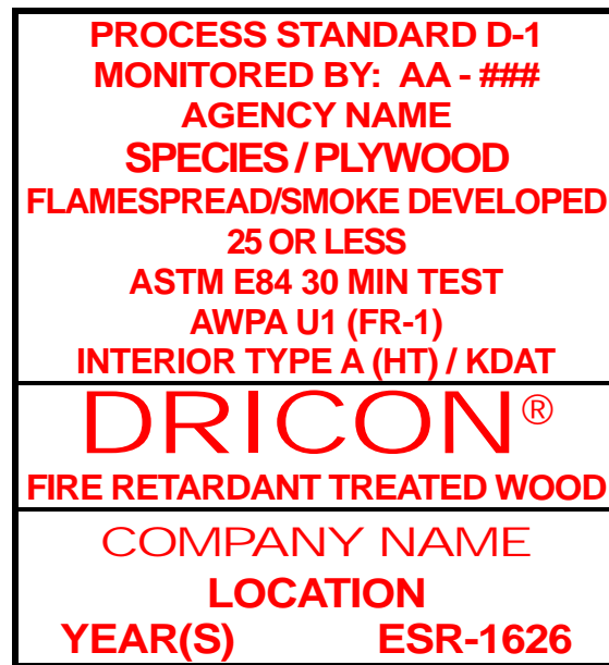
FIGURE 1—LUMBER AND PLYWOOD STAMPS 1,2,3